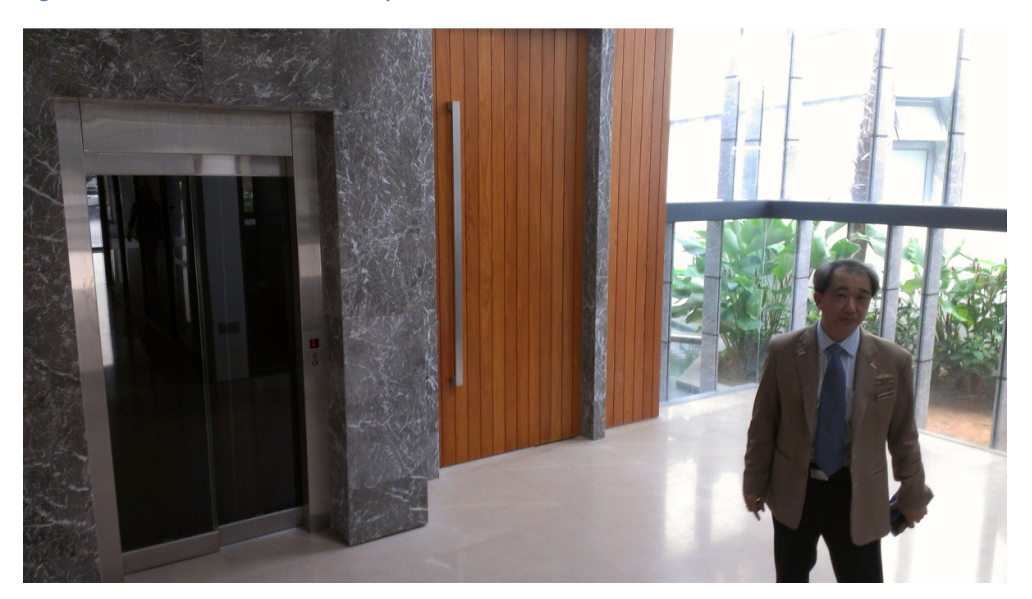
Figure 7 Inside main entrance; lift (elevator)