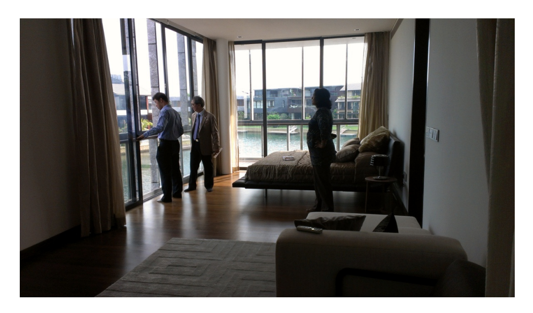
Figure 12 One of the bedrooms