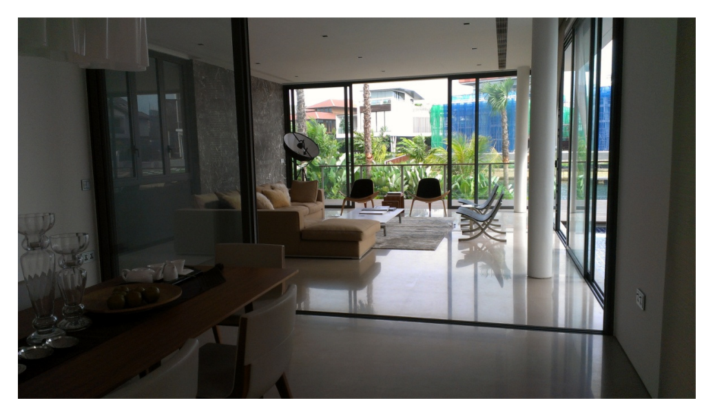
Figure 8 Living Room / Dining Area