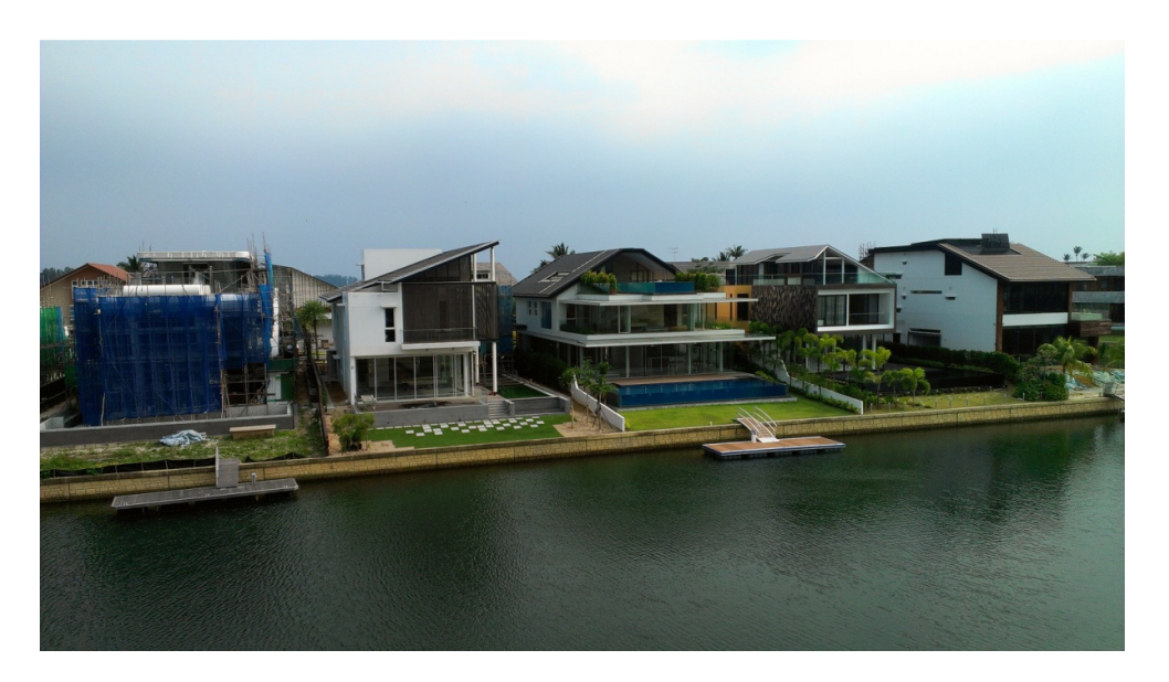
Figure 15 View from 3rd storey deck – Neighbouring Bungalows