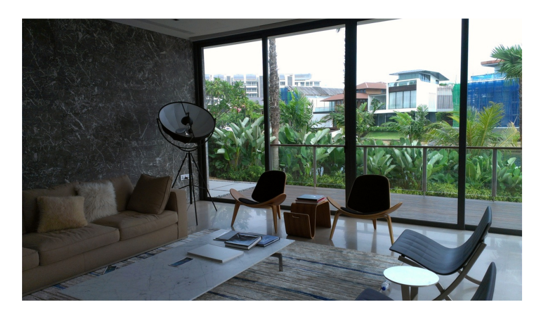
Figure 9 Living Room