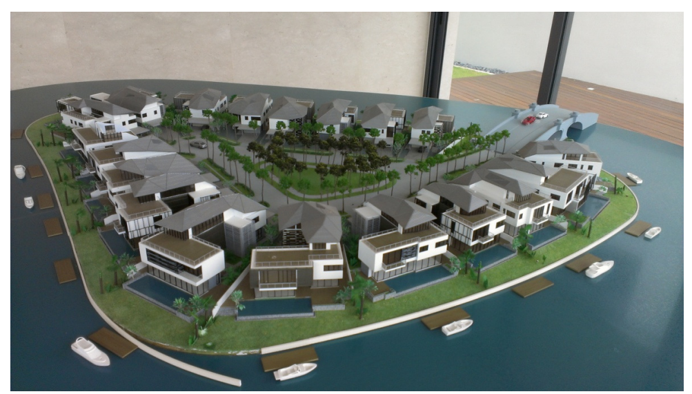
Figure 1 Scaled Model - exclusive 19 bungalows on an island

6 units have been sold; 3 units pending. Only about 10 units left.