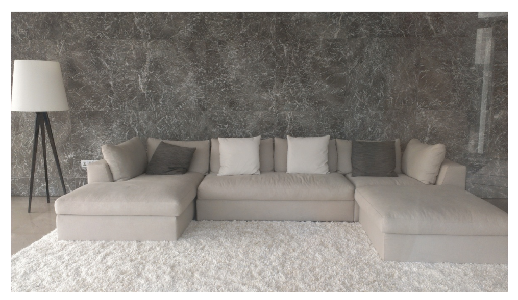
Figure 11 Entertainment Lounge