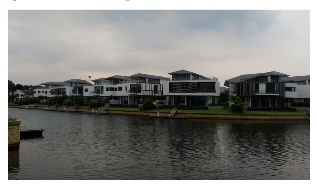
Figure 2 Actual View of the development