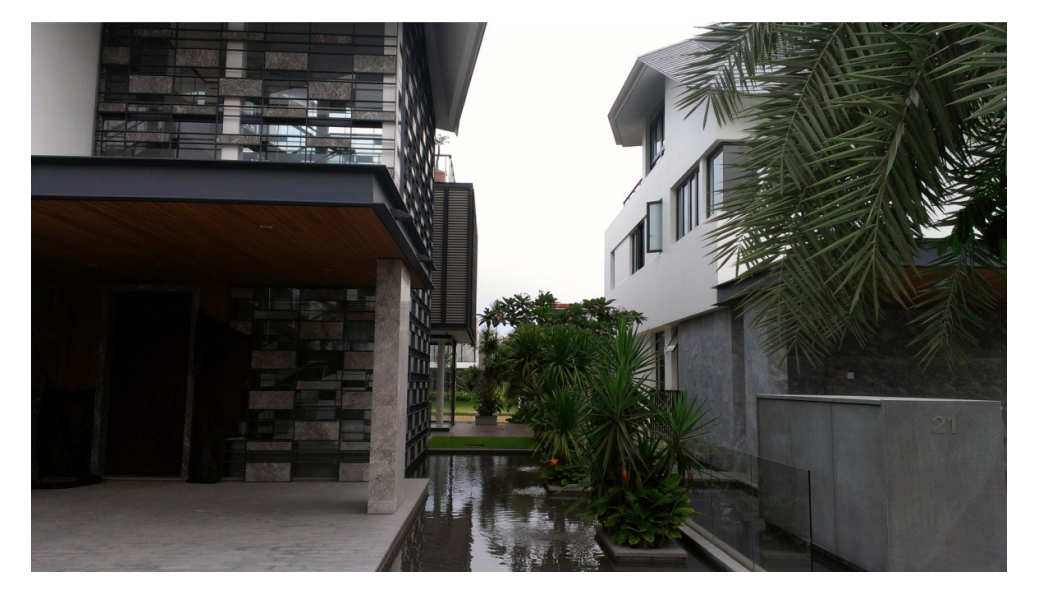
Figure 5 Side view of the bungalows