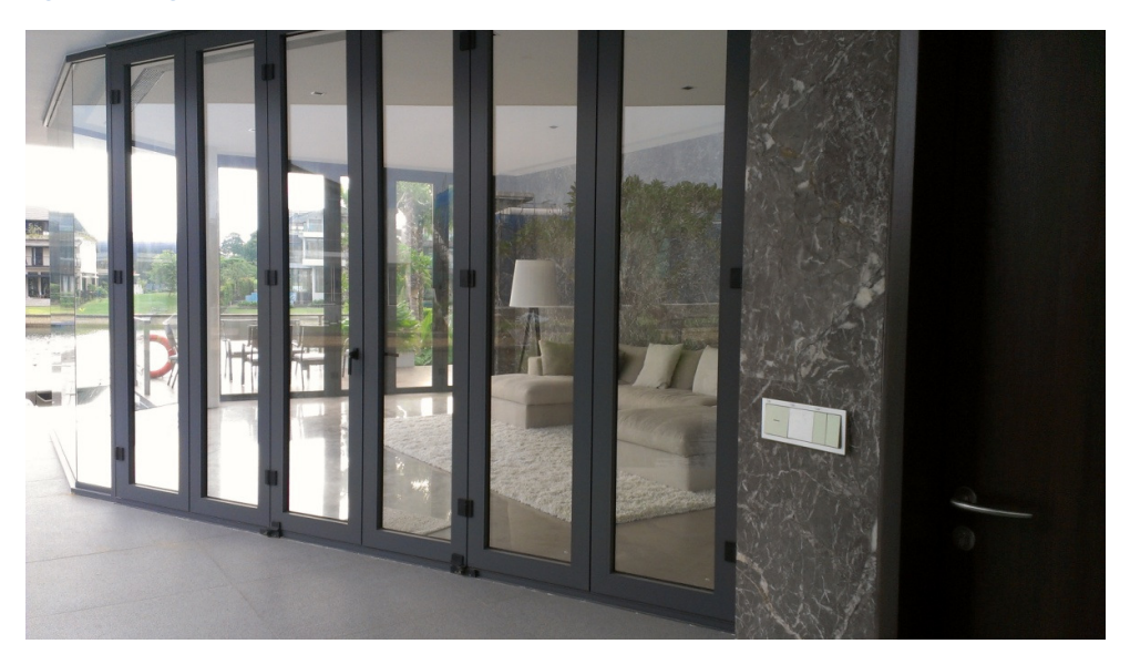
Figure 10 Entertainment / Guest Lounge