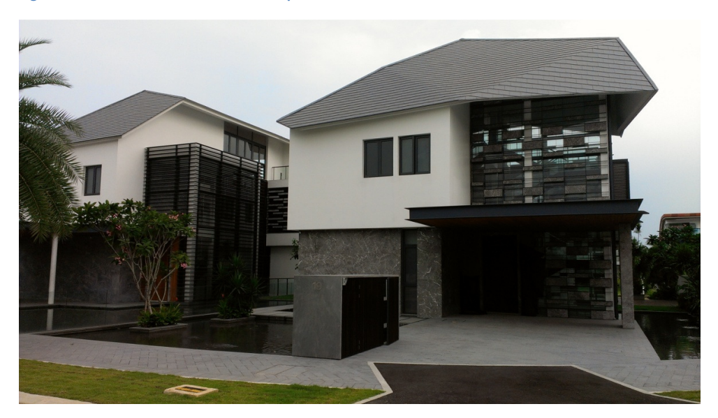
Figure 4 One of the 19 bungalows