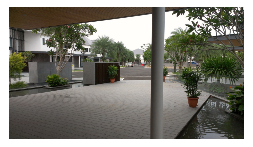
Figure 6 View from front entrance car park