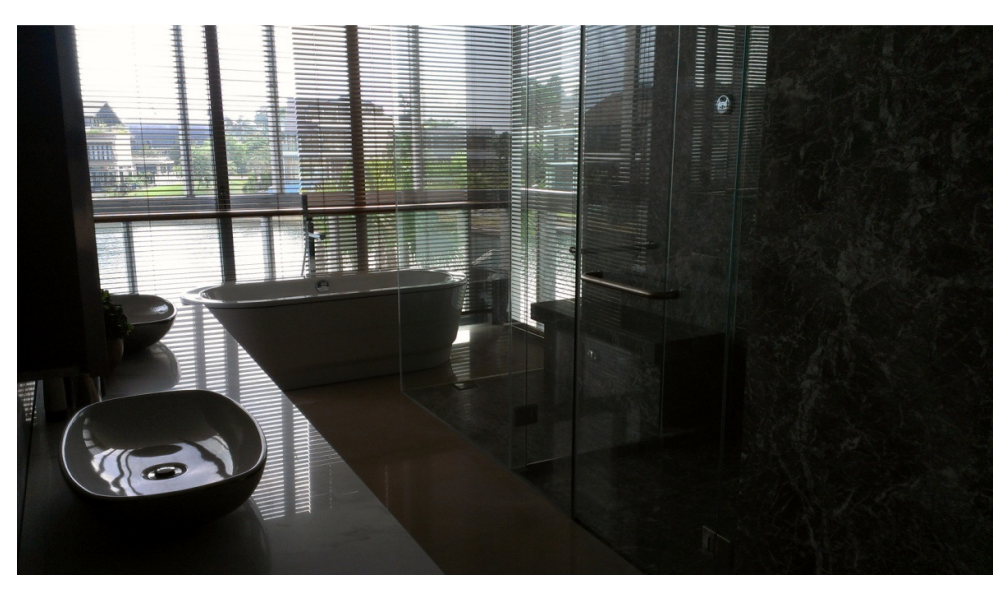
Figure 14 En-suite Bathroom