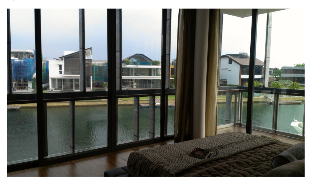
Figure 13 View from bedroom