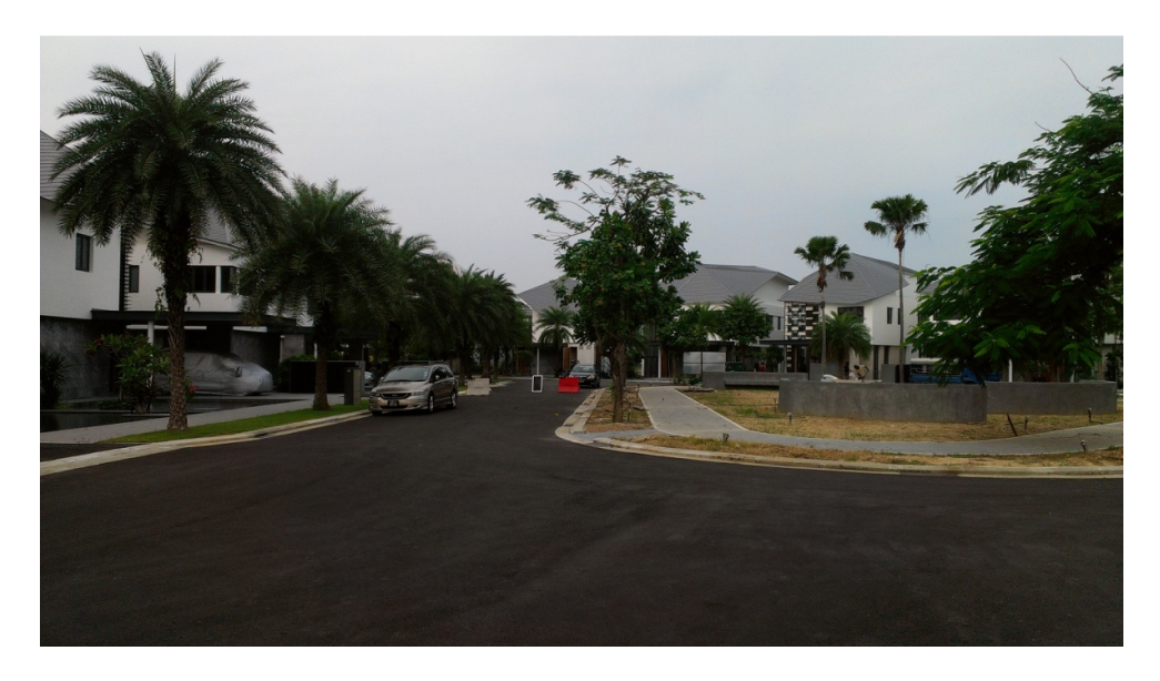
Figure 3 Actual view of the island development