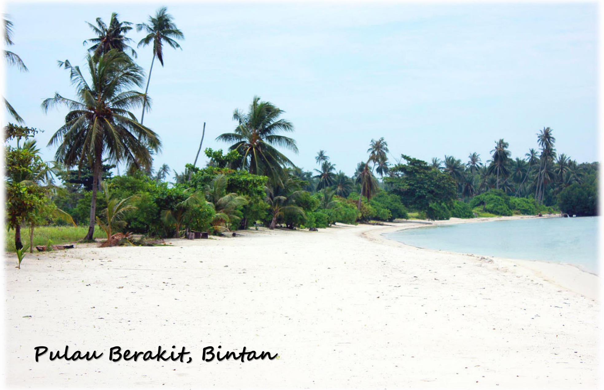
Pulau Berakit, Bintan